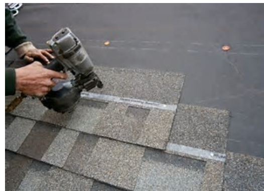
Owner-Occupied Roof Replacement