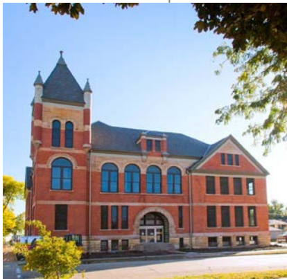
Roosevelt School Apartments