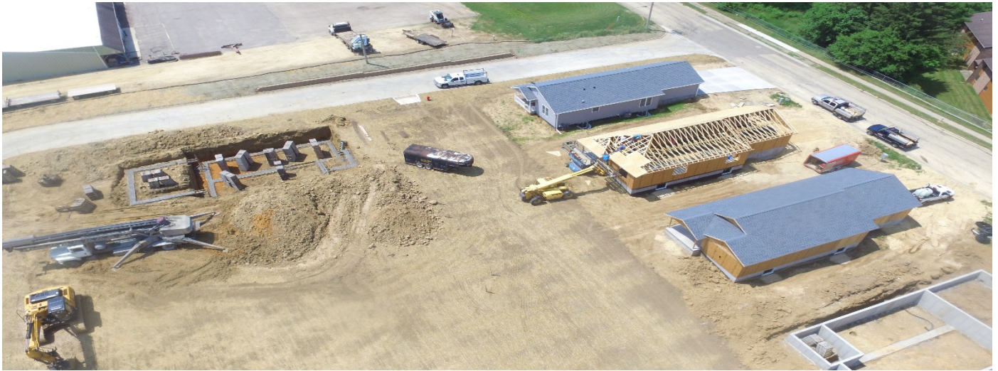
New Homeownership Development (Bear River Cottages - Maquoketa, IA)