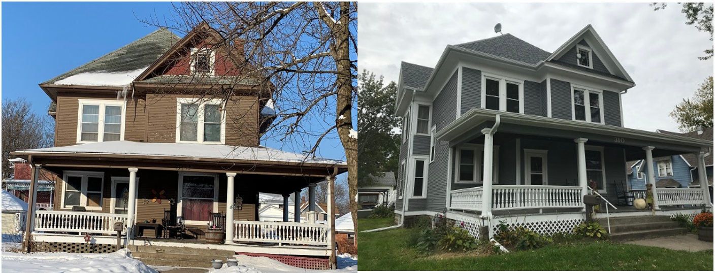
Lead Reduction (Before and After)

2019 - Iowa Finance Authority's Local Housing Trust Fund Program granted $ 326,554.00 to EIRHC HTF with an additional $ 136,289.00 in match funds, secured from recipients to be awarded back into area programs